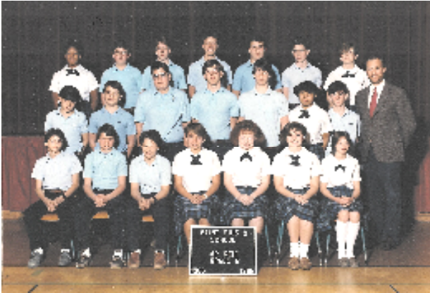
Class of 1986